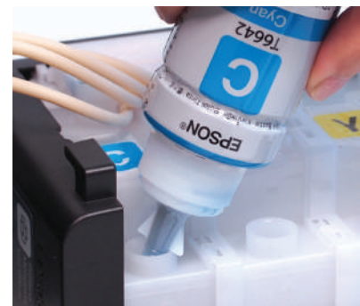
Smart tip design for easy, mess-free refills