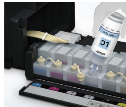
Specially fitted tubes ensure reliable ink flow without leakage

Epson's original EcoTank system is engineered for easy, mess-free refills. The special tubes in the printer are designed to ensure smooth and reliable ink flow at all times.